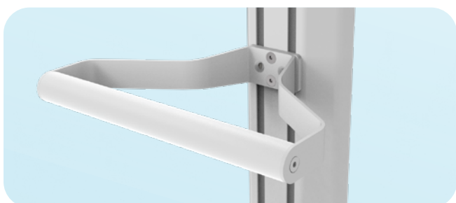
Easily fix on C5 column